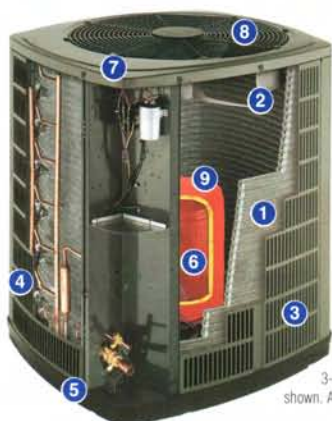
3-ton Allegiance 15 shown. All others may vary.