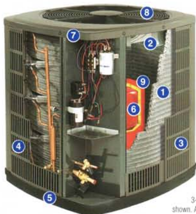
3-ton Allegiance 13 shown. All others may vary.