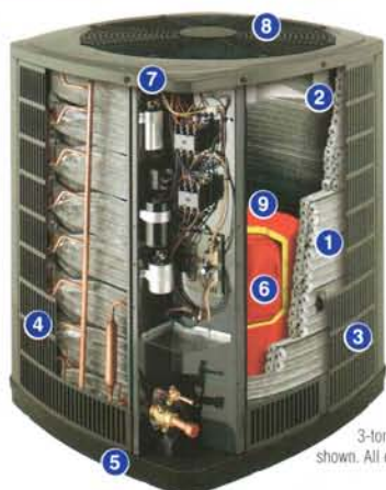
3-ton Allegiance 18 shown. All others may vary.